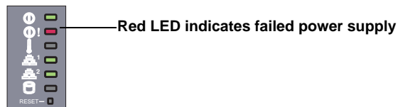
Figure 1 DSS200 Front-Panel Power Supply Indicator

The Dolby® DSS200 requires only one power supply; a second unit is provided for backup. If a problem occurs with either of these redundant power supplies, the power failure indicator LED on the front panel changes from green to flashing red (see Figure 1 ). You can replace a failed power supply (Dolby Part Number 4901580) during a show, but to avoid accidentally removing the wrong unit, wait until the theatre is empty (as the system continues operating with one power supply).